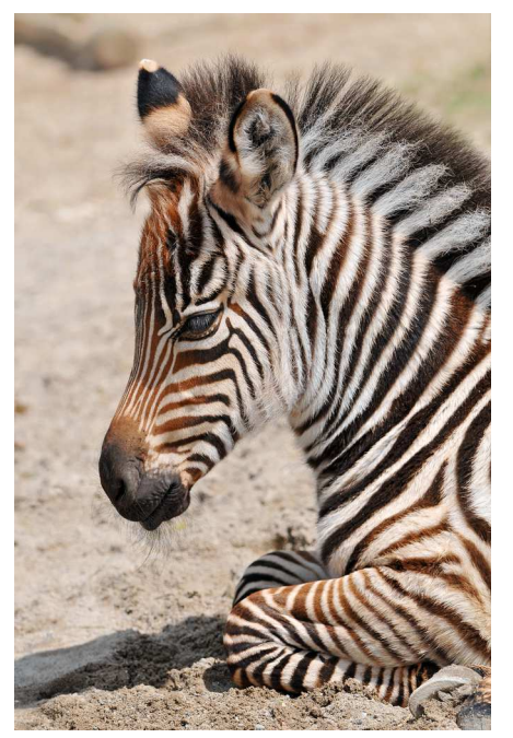
Very young zebra