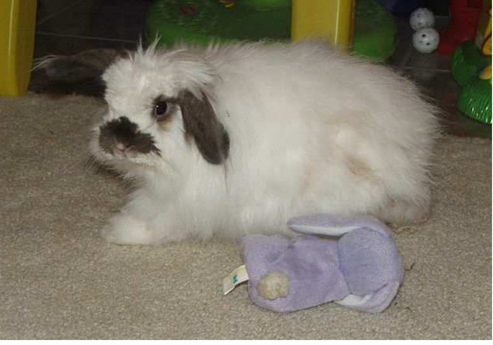
American Fuzzy Lop

For mandoc, full functional coverage requires running afl continuously for several days on modern PC hardware.