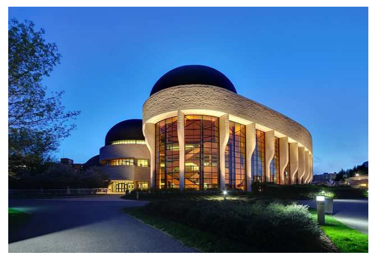
Canadian Museum of History, Gatineau

• Support automatic semantic enrichment of Perl manuals with pod2mdoc(1). (first mentioned: EuroBSDCon 2014)