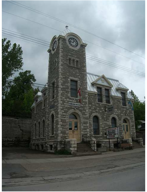
Bonnechere Museum, Eganville