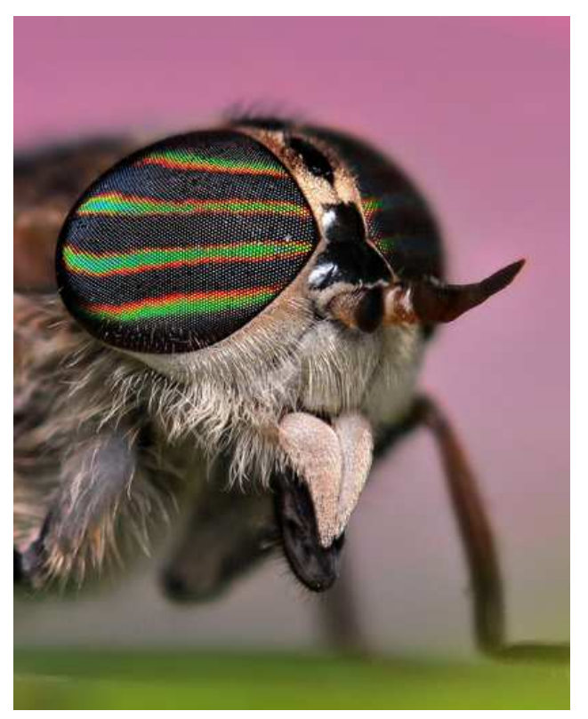
Horse Fly Portrait

Users don't remember and don't use them.