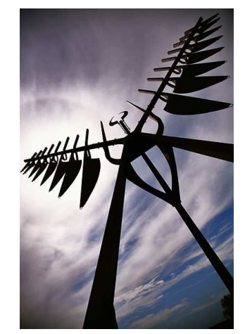
Spiritcatcher by Ron Baird (1986) in Barrie