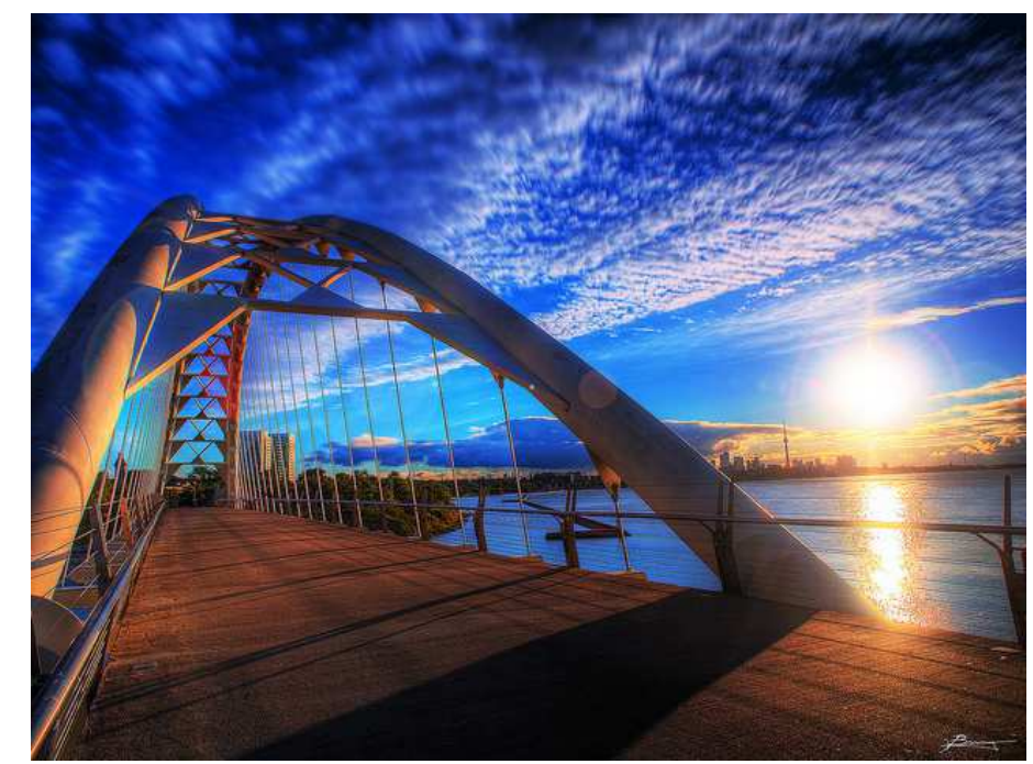
Humber Bay Bridge, Toronto

and manual maintenance of the USE_GROFF variable.