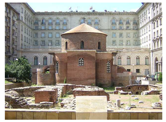
Ротонда Свети Георги, София