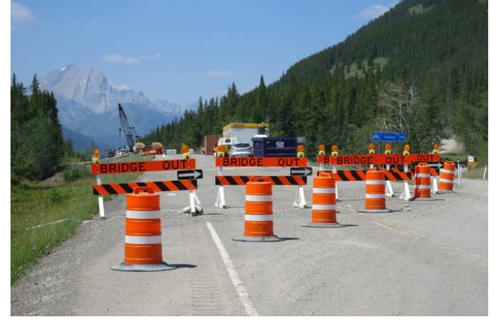
Mist Mtn. (3138m) from Lineham Creek Bridge (1680m) Elbow-Sheep Wildland Provincial Park, Kananaskis, Alberta, Canada

Definitions of syntax elements (functions, keywords, flags, variables, errors) So far used for local searching only (no linking/nothing remote yet; both non-trivial) Having a way to handle targets at all is a crucial step, and logical as a first step! It's already quite useful. \rightarrow live-demo