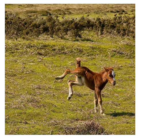
Foals Just Wanna Have Fun