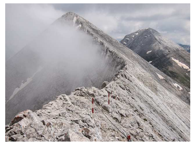
Кутело 2908м и Вихрен 2914м, Пирин

One simple, versatile language: mdoc(7 ) — with a long tradition: