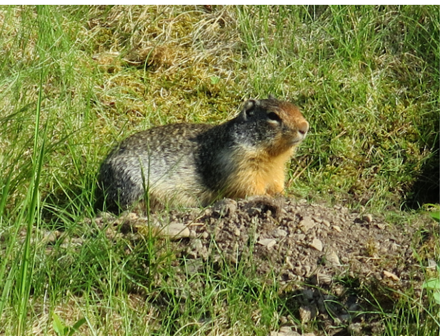
Yellow Bellied Marmot, Canyon Campground Kananaskis, Alberta

• no new macros, no new syntax whatsoever