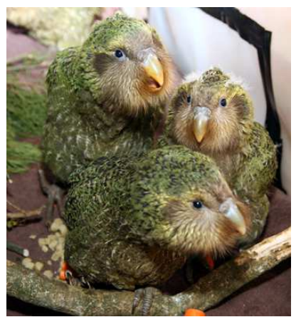
Kakapo chicks (Strigops habroptilus)