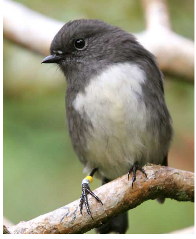
Robin / Toutouwai (Petroica australis)