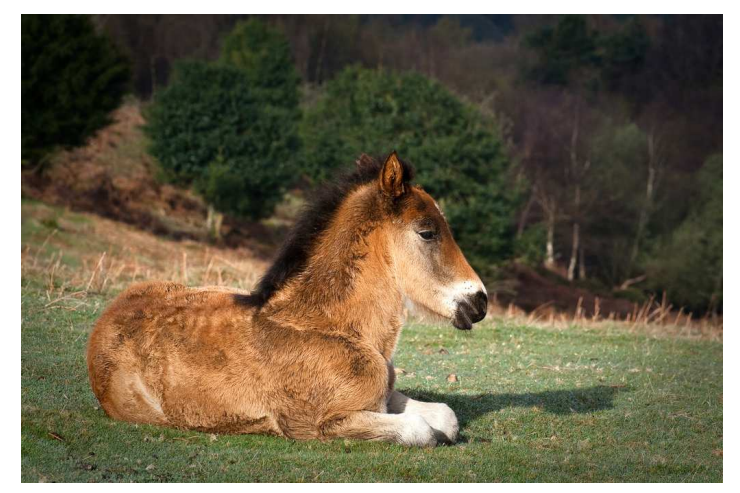
A Youngster on the Quantocks