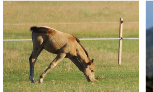
Csikó — Foal

mandoc: becoming the main BSD manual toolbox BSDCan 2015