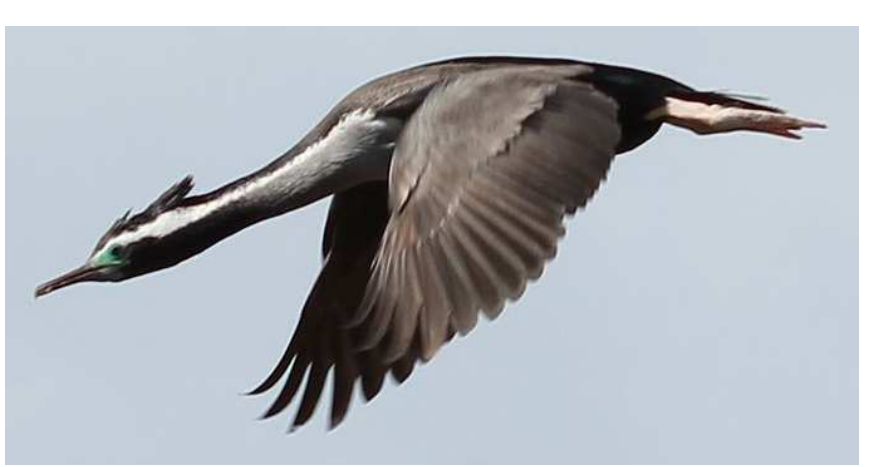
Spotted Shag / Parekareka (Phalacrocorax punctatus)