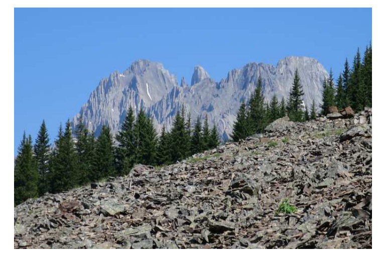
Elpoca Mountain 3029m from the Rock Glacier 2100m Kananaskis Trail, Alberta