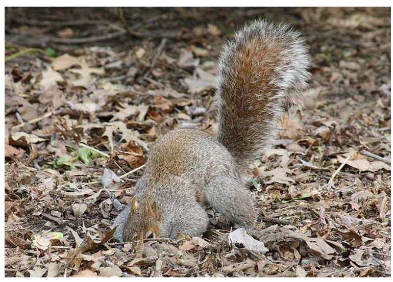
Squirrel digging