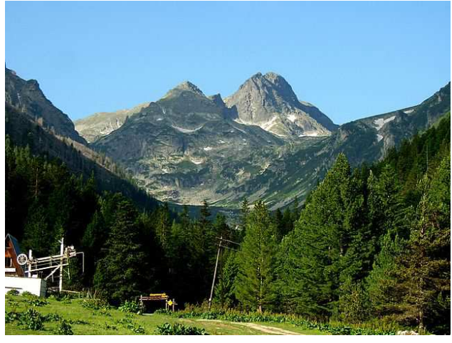
Мальовица 2729м, Рила, Bulgaria