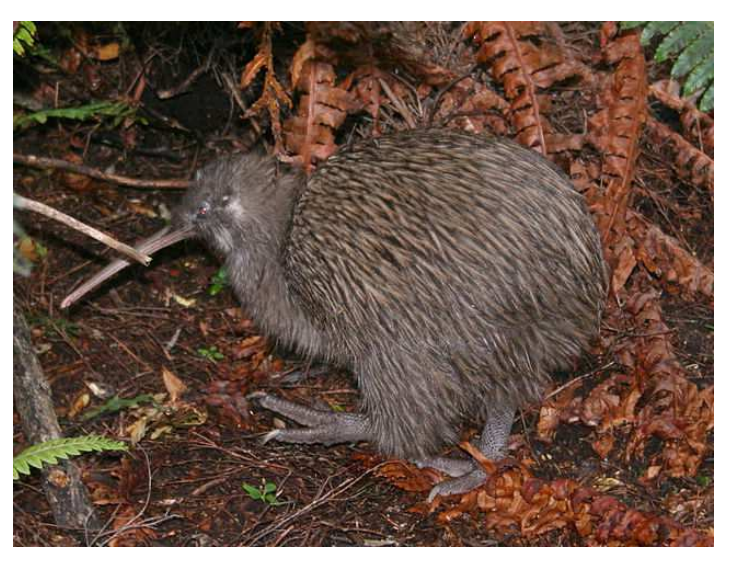
Southern Kiwi / Tokoeka (Apteryx australis)