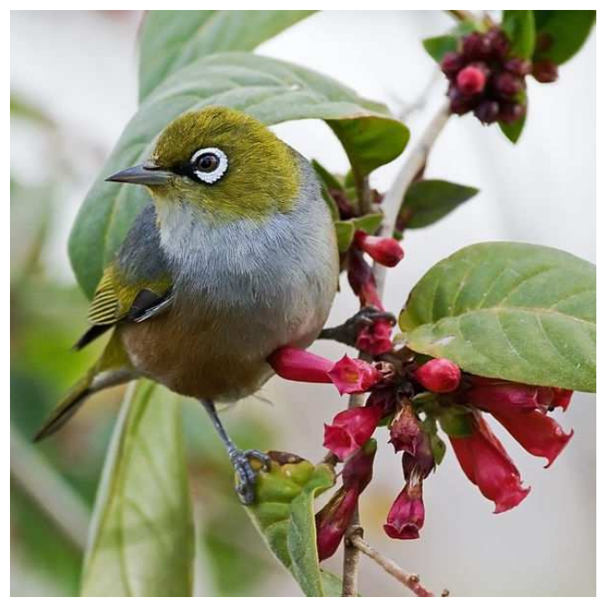
Silvereye / Tauhou (Zosterops lateralis)