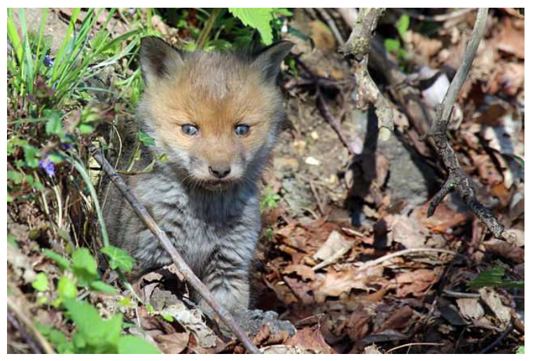
Red fox kit (Vulpes vulpes)